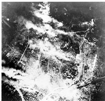
Tokyo burns under B-29 firebomb assault