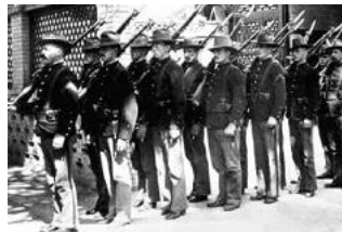
U.S. Marines - Part of the international relief expedition sent to lift the siege of Peking.